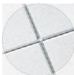
ULTIMA Vector with PRELUDE 15/16" Exposed Tee grid

OPTIMA/ULTIMA Vector Seismic Clip placement grid resting on molding