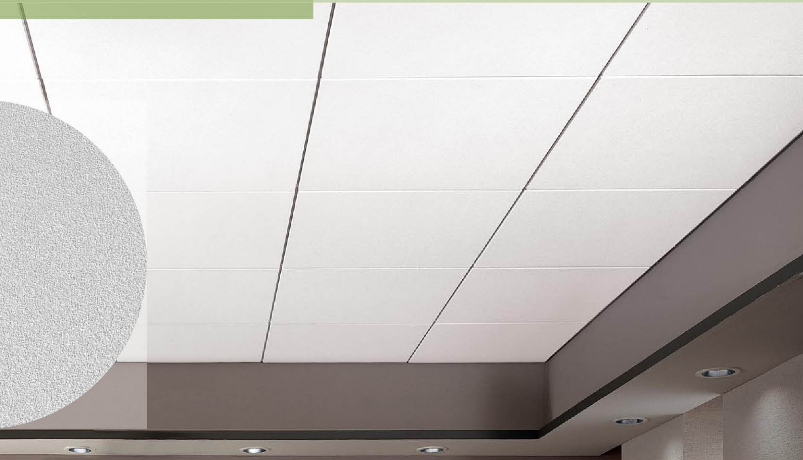
Ultima Vector with Prelude® 15/16" Exposed Tee grid; Drywall Grid Soffit